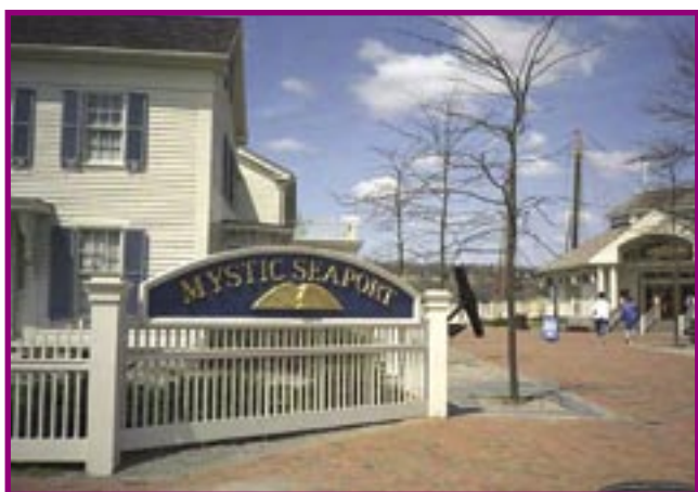
The Mystic Seaport Entranceway.