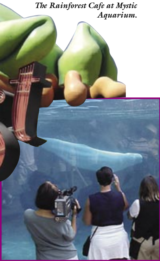
Beluga whale watchers at the Mystic Aquarium.