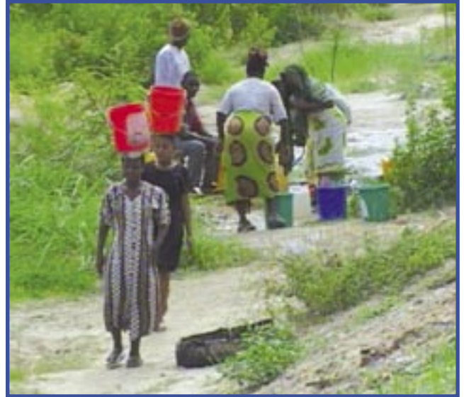
Women and children in Tanzania may walk up to 8 miles to retrieve water.