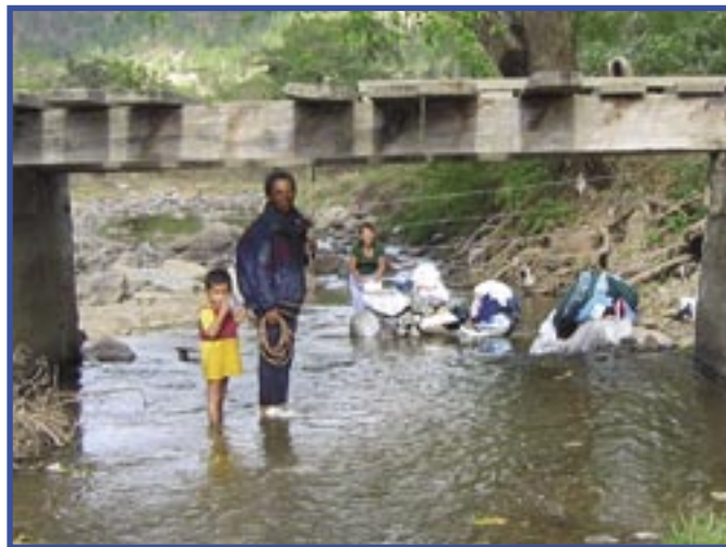
Families in rural Honduras launder clothing in the streams.