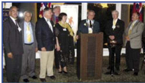
Assistant Governors are sworn in.