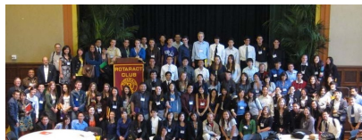
Rotaract Big West Conference Berkeley, October 2010