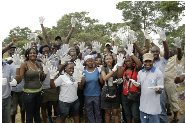
Rotaractors who hired the gloves and are ready to get to work.