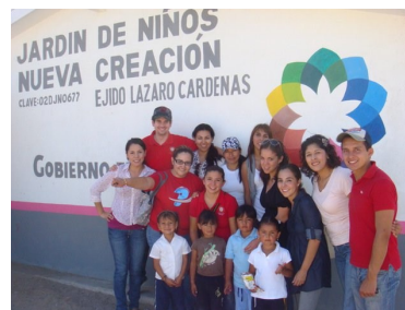
The Rotaract Club Tijuana Oeste (D4100) donated 45 pairs of new shoes to all the kids at a kindergarten in the outskirts of Tijuana, Mexico.