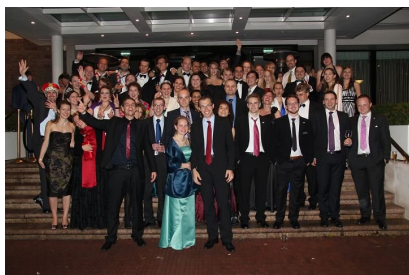
Rotaract European Meeting (REM) Amsterdam, October 2010